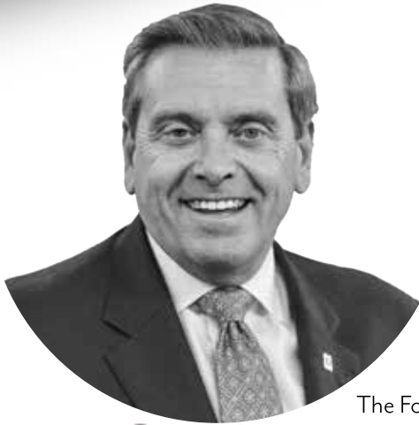
Board Chair 2018-2019 Mayor, City of Bedford

As I conclude my service as board chair and reflect on the past few years of work at the Foundation, I'm struck by the unwavering support of the Hurst-Euless-Bedford community for the staff and students of HEB ISD. From our generous corporate community, to individual donors and even our own HEB ISD staff donors, it has been phenomenal to see each one of you step up and make dreams come true for our educators.